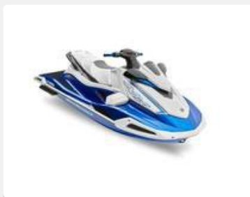
2022 Yamana VX Cruiser with a Chilton Trailer