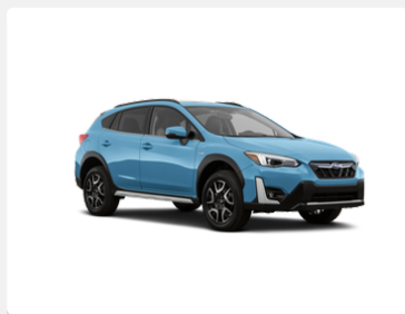
2022 Subaru Crosstrek Hybrid

Ultimate Packers Package - See the Packers battle the Chicago Bears , the Detroit Lions and the Minnesota Vikings at Lambeau Field during the 2022-23 season with four tickets to each game.