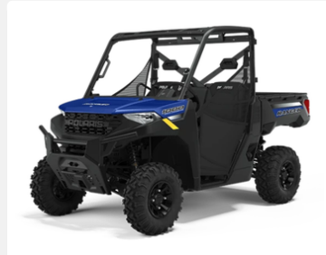
2022 Polaris Ranger 1000