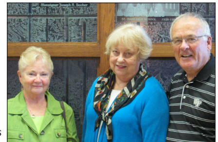
Class of 1961 Visitors