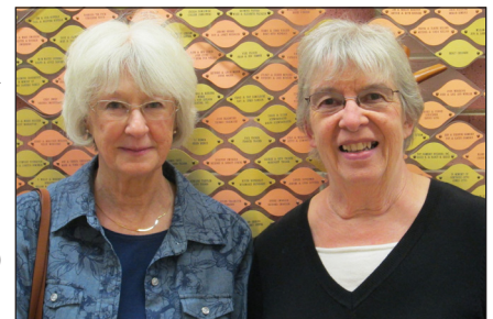
Class of 1958 Visitors