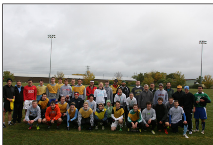
SMC Soccer Alumni