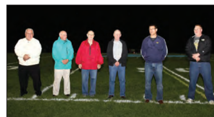
SMC Hall of Fame Inductees introduced at Homecoming